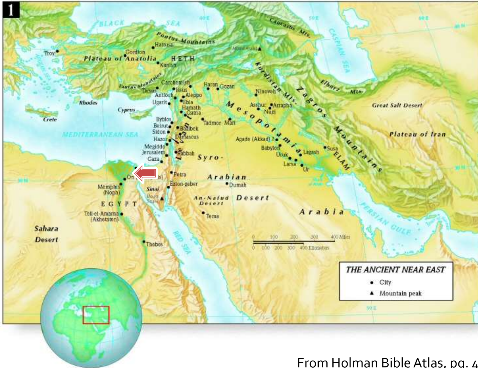
From Holman Bible Atlas, pg. 4