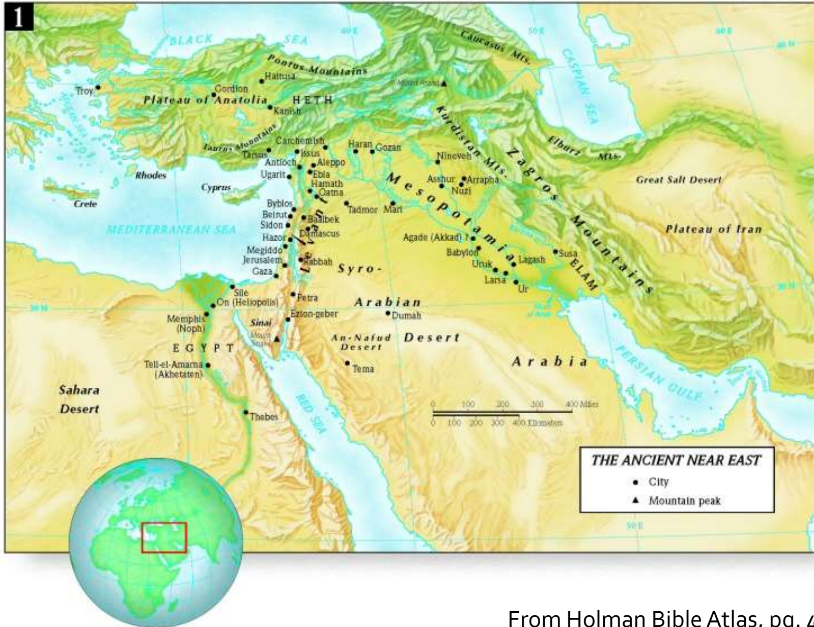
From Holman Bible Atlas, pg. 4